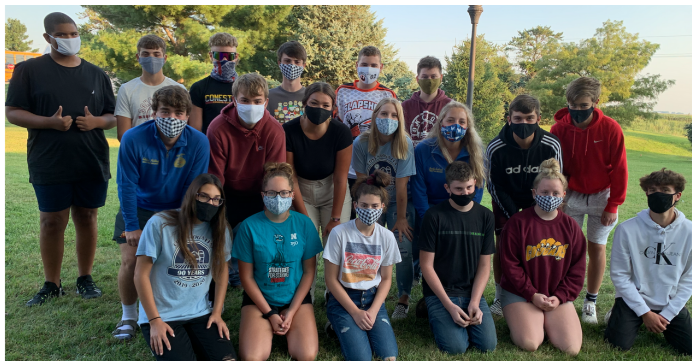
Nineteen FFA members attended the kickoff meeting on Wednesday, August 26th!