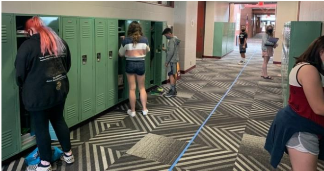
Adjustments have made to hallways, lockers and passing periods to keep out students safe.