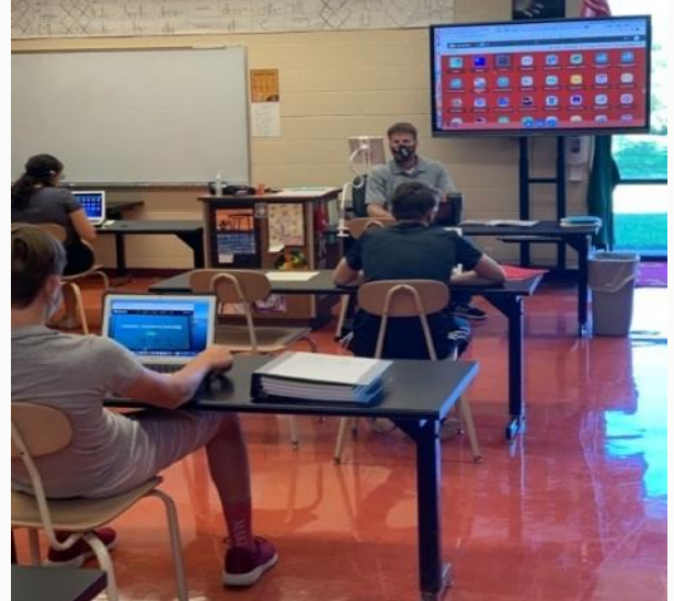
Classrooms are designed to keep students safe and when social distancing cant occur, masks are worn.