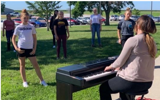
Teachers are utilizing outdoor space for classrooms.